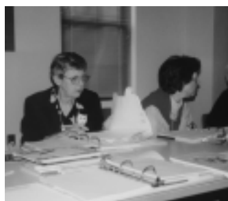
Conference participants learning how to preserve synagogue archives