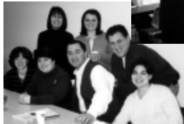
HUC-JIR rabbinical students participating in the "Promoting Jewish Identity in an Age of Choice" Seminar, Buffalo, 1999