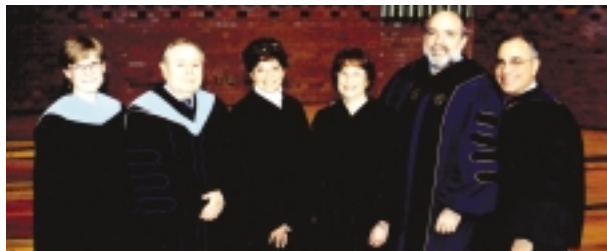
New York: Education alumni awarded the Doctor of Jewish Religious Education, honoris causa.