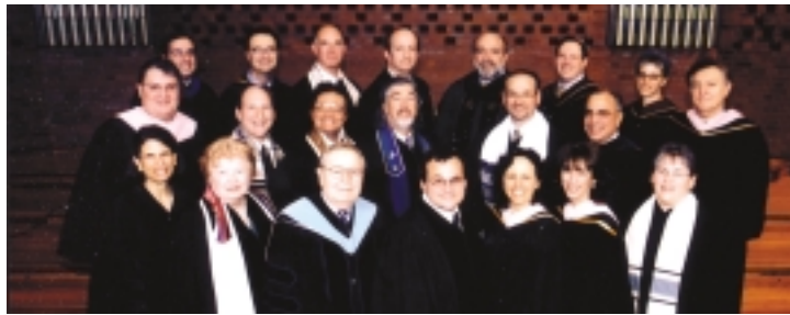
New York: Cantorial alumni awarded the Doctor of Music, honoris causa.