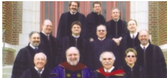
Cincinnati: Honorary Doctor of Divinity and Doctor of Jewish Communal Service degree recipients