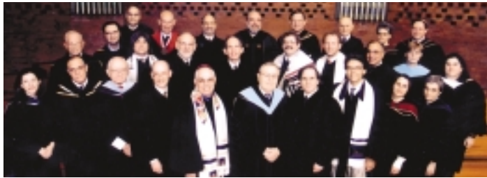
New York: Rabbinical alumni awarded the Doctor of Divinity, honoris causa.

Each year, Founders' Day Ceremonies celebrate the vision of Rabbi Isaac Mayer Wise, founder of HUC in 1875 in Cincinnati, and of Rabbi Stephen S. Wise, founder of the JIR in 1922 in New York. Inspired by their legacy, the College-Institute's academic programs, faculty, and students are committed to fulfilling their mission of a Judaism responsive to modernity. On Founders' Day, the College-Institute honors distinguished alumni for devoted years of service as preservers and teachers of Judaism's faith, culture, and communal ethics. As leaders of Jewish communities throughout the world, they forge the links of Jewish scholarship and spirituality that ensure the continuity of our heritage for the generations to come.